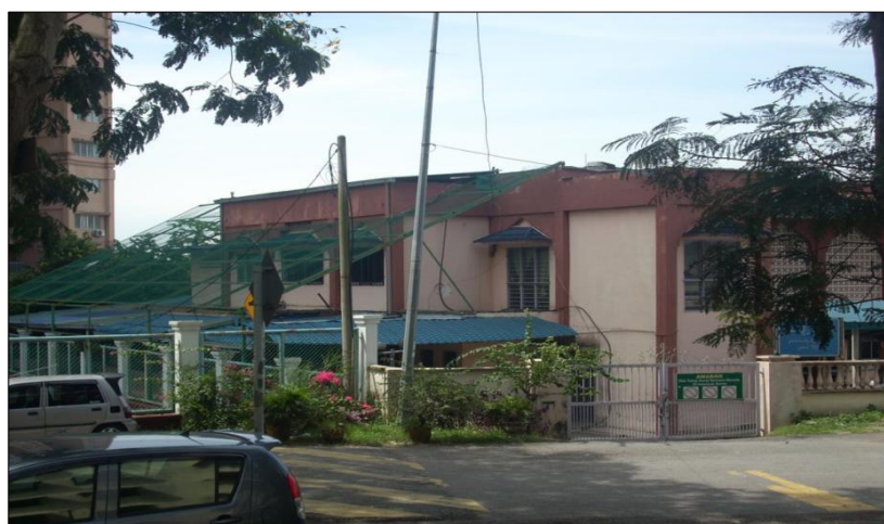
Figure 1 The fence on the roof of the surau was built due to provocation

Table 3 shows the mean and competition mode in the community for the entire respondent and according to ethnic breakdown. The competition mean in the community for the entire respondent was 3.72 rated as having a low level of competition. The mean of the Malay respondents' competition was at a low level, while the mean competition between Indian and Chinese respondents was moderate.